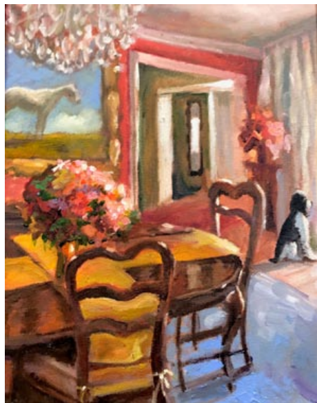
Work by Joyce Hall For gallery listings, call 843/577-5500 or visit ( www.dogandhorsefineart.com ).

MORE DEMOCRATIC WOMEN ELECTED TO OFFICE AT ALL LEVELS OF GOVERNMENT