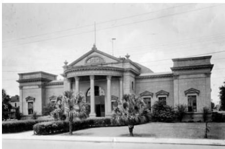
Exterior view of The Charleston Museum when located at 121 Rutledge Avenue.

After The Charleston Museum's founding in 1773 by the Charleston Library Society, it was subsequently overseen by the Library Society, the Literary and Philosophical Society of South Carolina, the Medical College of South Carolina, and the College of Charleston. In 1907, Charleston's city council offered the newly built Thomson Auditorium on Rutledge Avenue to house the Museum and provided funding to support the growing institution. Over the years, Museum directors continued the expansion of exhibits and educational programs and fashioned the Museum into a much loved cultural institution in the Charleston community.